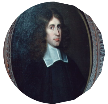
Rev. George Gillespie was born, son of the Old Kirk Minister, in 1613, 400 years ago this year.

A group has been researching George Gilles-